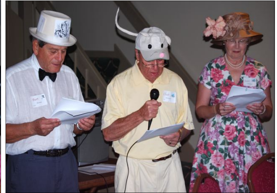
The hosts - the Mad Hatter, the Dormouse, the Red Queen.