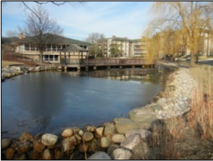
Jan. 10 - record breaking high of 51°