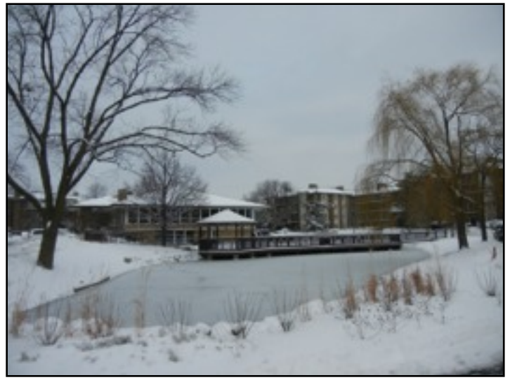
Jan. 12 - first snow of the winter