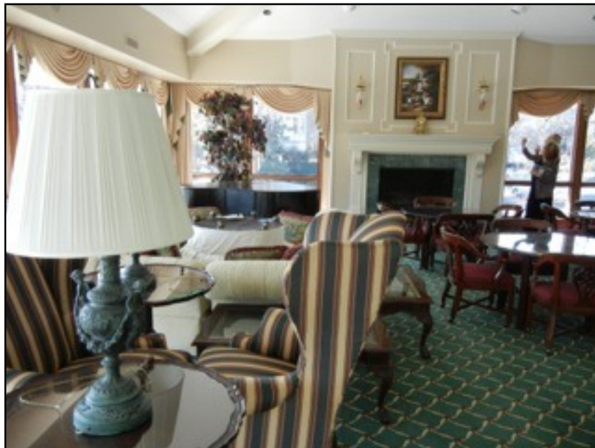
Scrambled furniture in the Club Room of the Clubhouse while the walls and woodwork get painted.