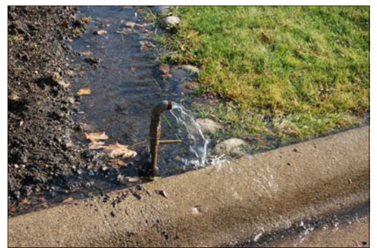
Above: Draining irrigation pipes Below: Flushing irrigation pipes