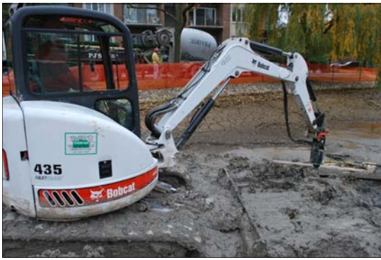
Drilling 10' down into the muck