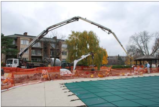
Concrete gets pumped up and over