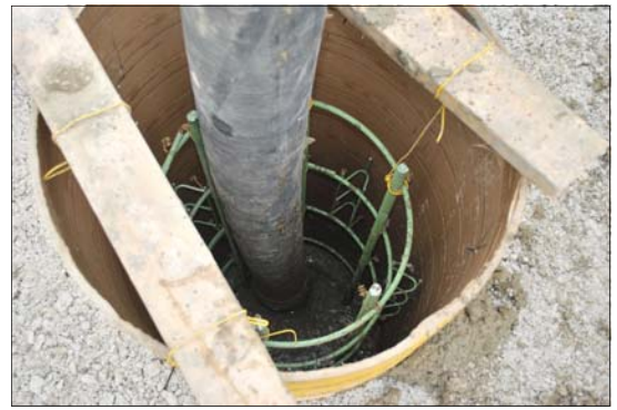
Looking down a future pier