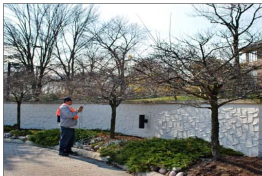
Above: Jose hanging holiday lights Below: Tulip planting