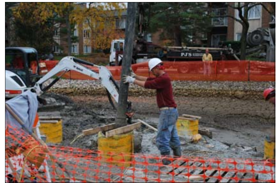
Guiding the pump tube